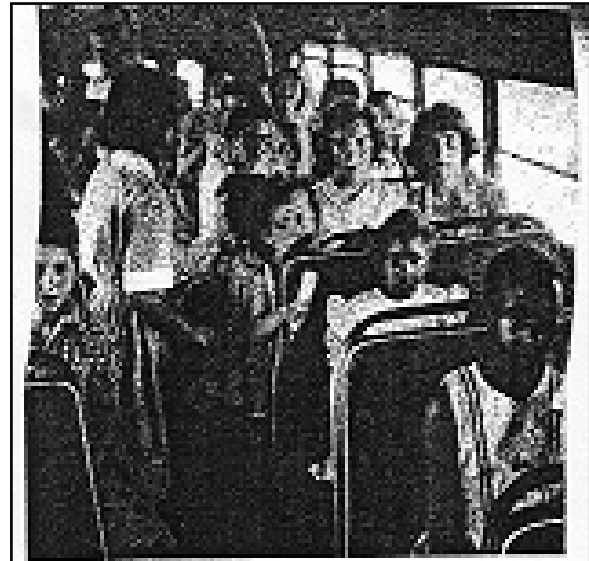
RIDING THE BUS. children are wary and uncommunicative as they approach school. Some white children sat with Negroes. Others chose to stand.