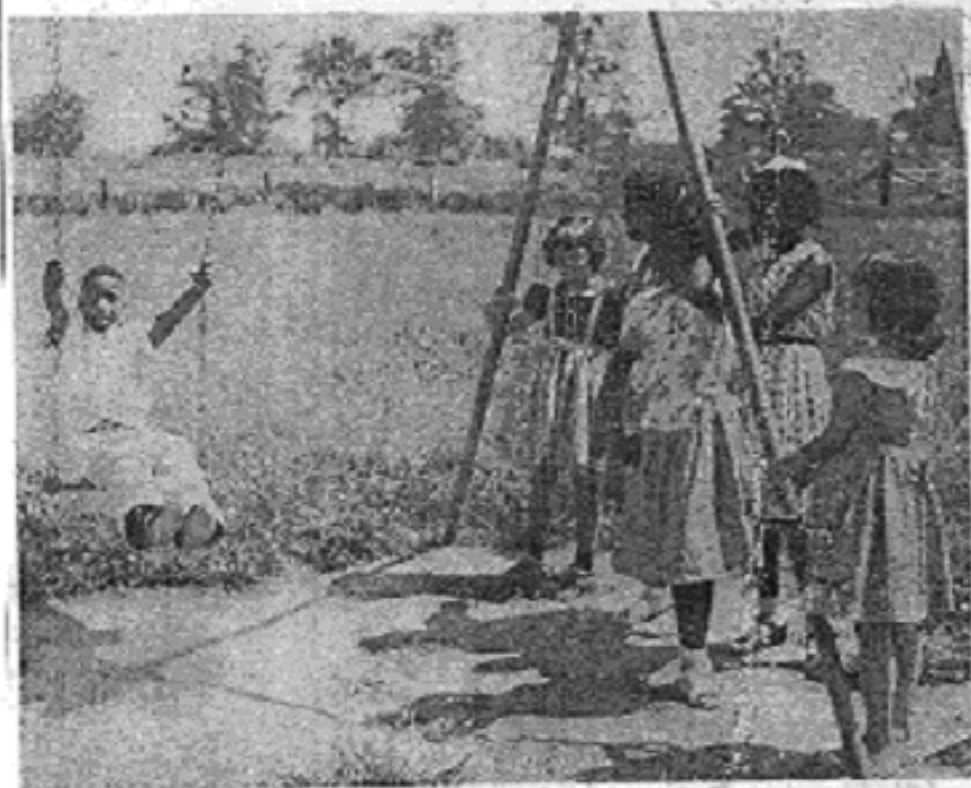
TAKING TURNS —White and negro children took turns on the swings and slides on the playground during recess at Hoxie School. Older children sat in the shade, while white and negro children together, talking in friendly fashion.